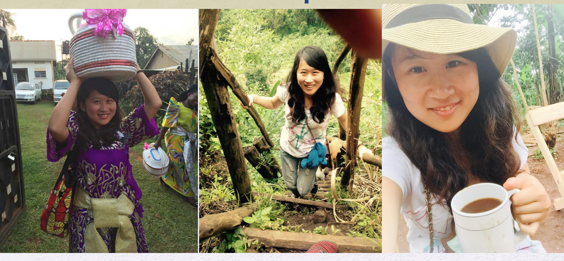
Wearing traditional clothes at a wedding