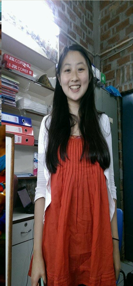
The CanSupport Daycare and Main Office in New Delhi