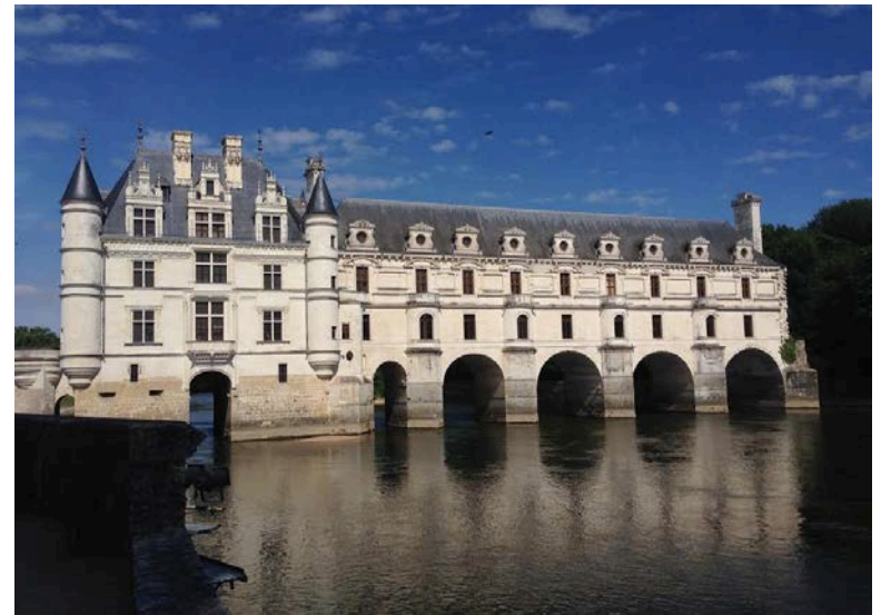
The château de Chenonceau in the Loire valley