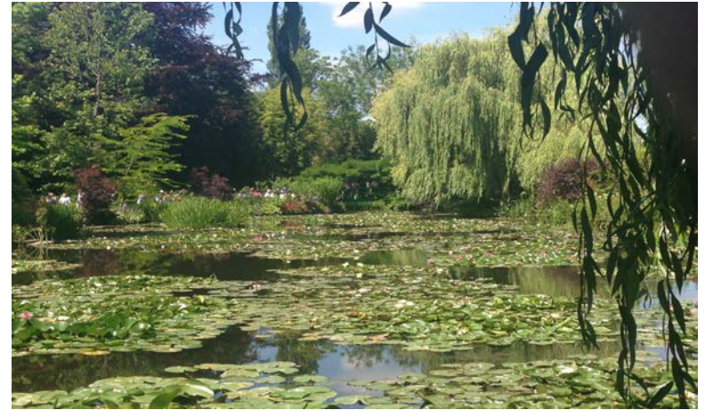
Monet's garden at Giverny