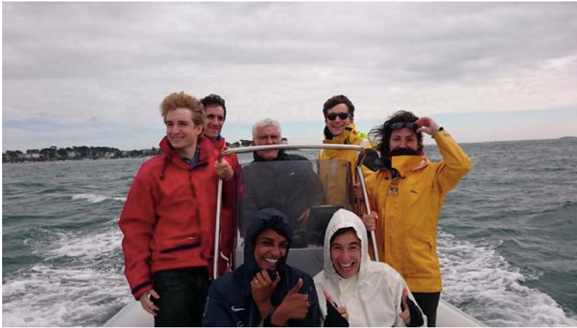
On a corporate retreat in La Trinité-sur-Mer (Brittany)