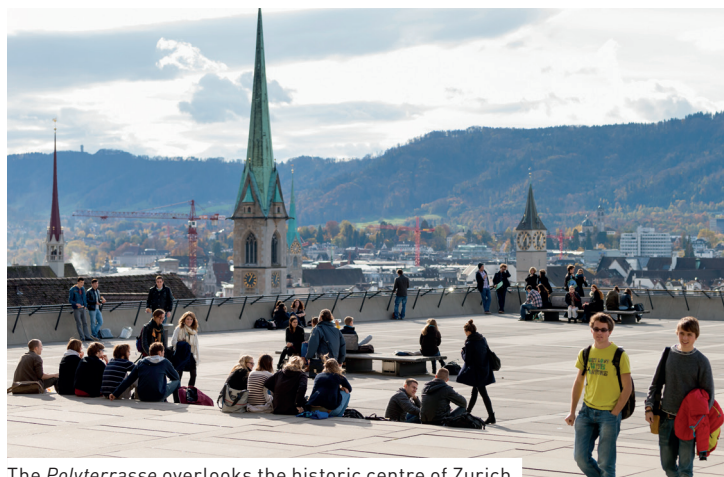
The Polyterrasse overlooks the historic centre of Zurich.