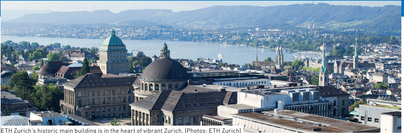
ETH Zurich's historic main building is in the heart of vibrant Zurich.