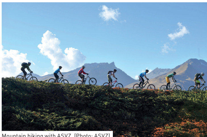
Mountain biking with ASVZ.