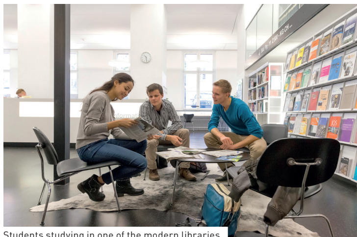
Students studying in one of the modern libraries.