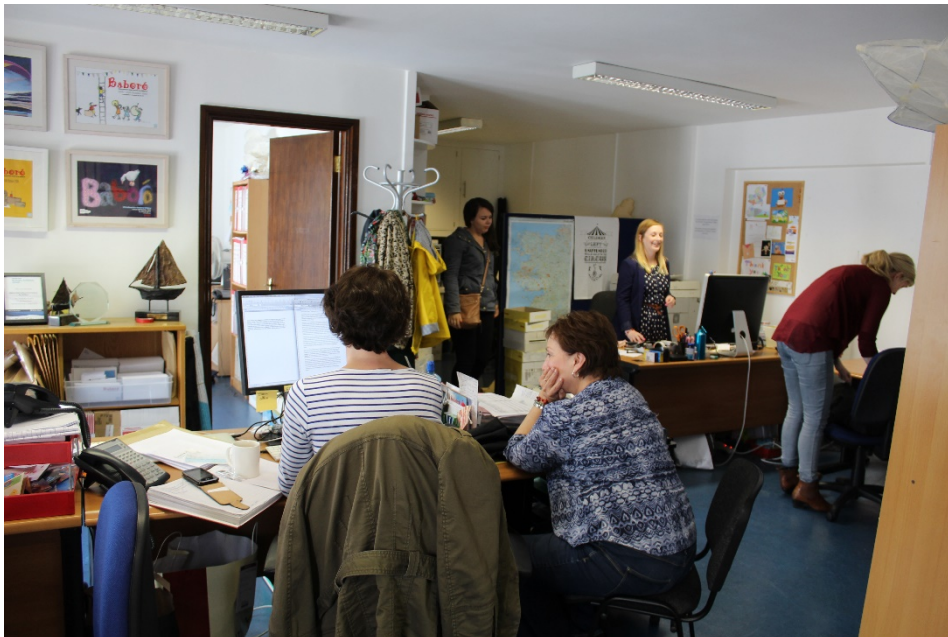
The office space