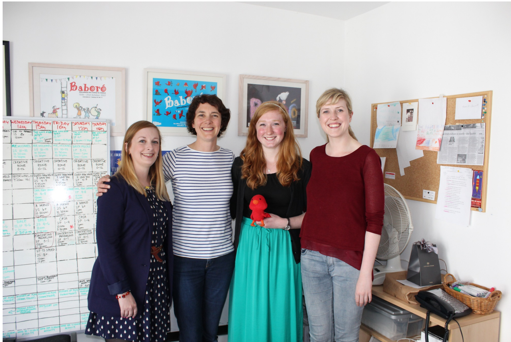
With my colleagues and Birdie, the Baboró mascot