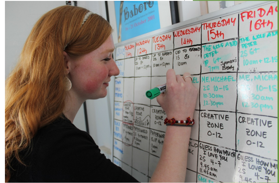
Updating the festival schedule board