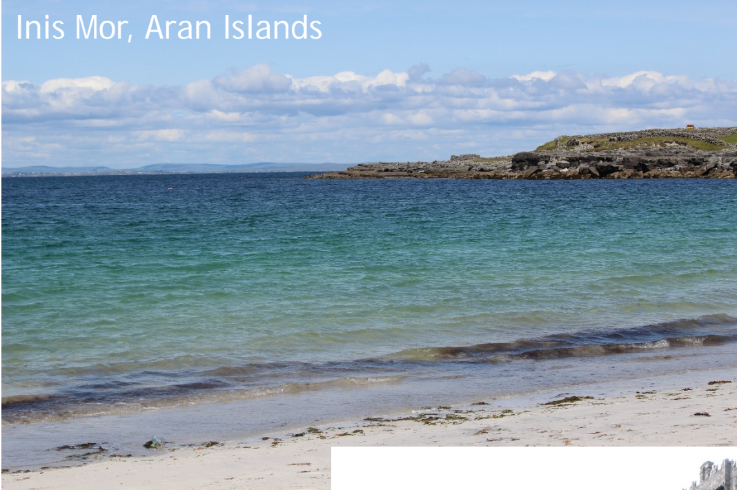
Inis Mor, Aran Islands