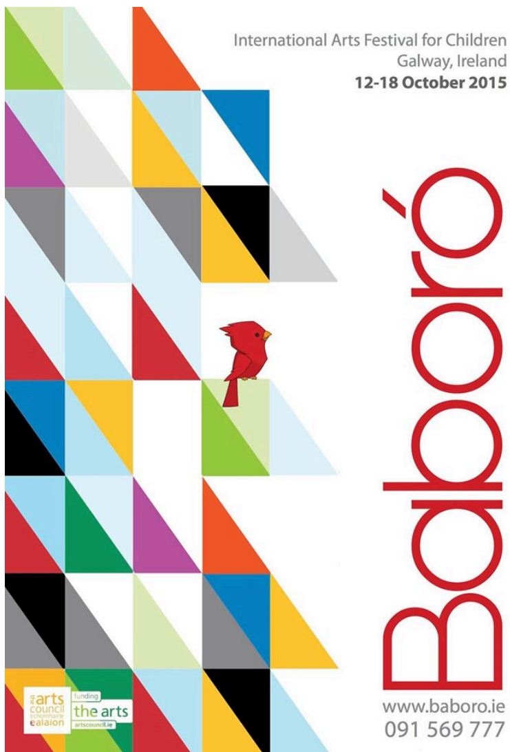
This year's brochure cover