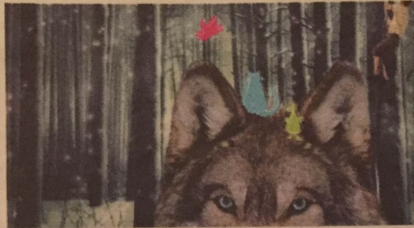
CoisCéim Dance Theatre's 'The Wolf and Peter'.

This classic story has been interpreted by many artists and CoisCéim Dance Theatre now bring this timeless story of courage and imagination to the stage this autumn. And this time... the story is also told through the eyes of the Wolf.