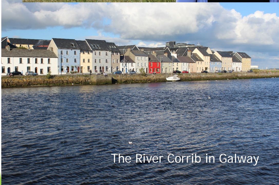
The River Corrib in Galway