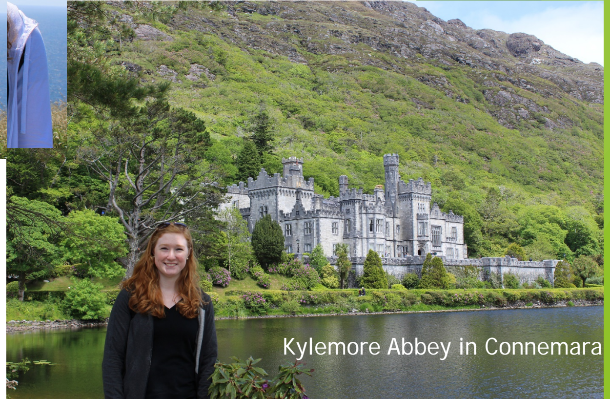
Kylemore Abbey in Connemara