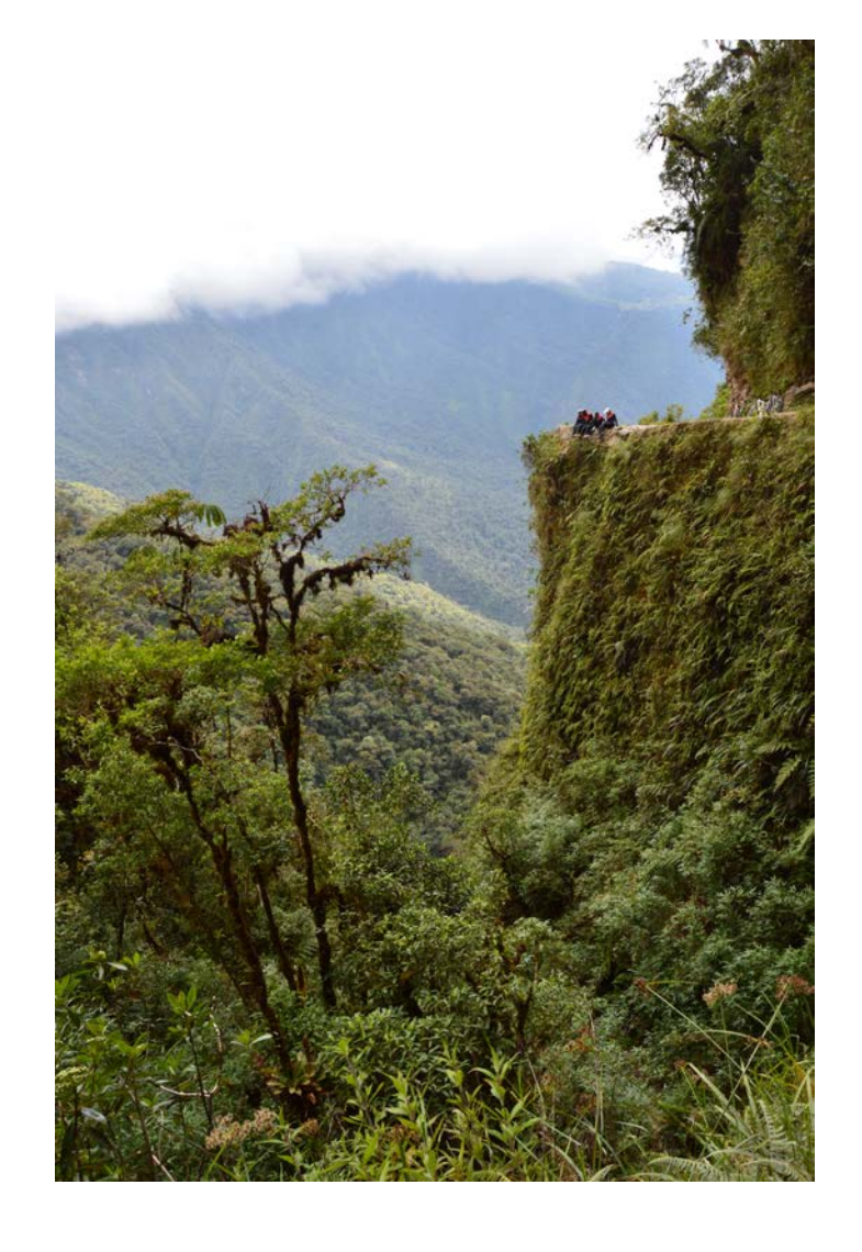
Biking down Death Road