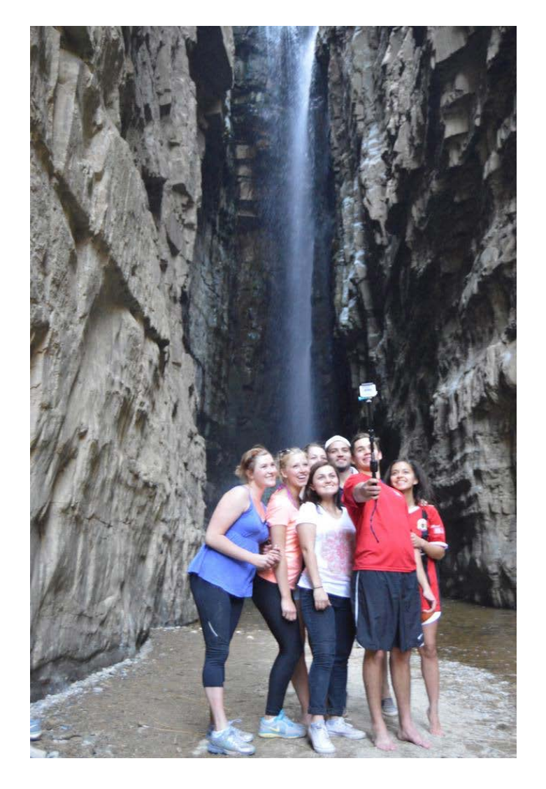
Aymarran New Year, Isla del Sol, Lago Titicaca