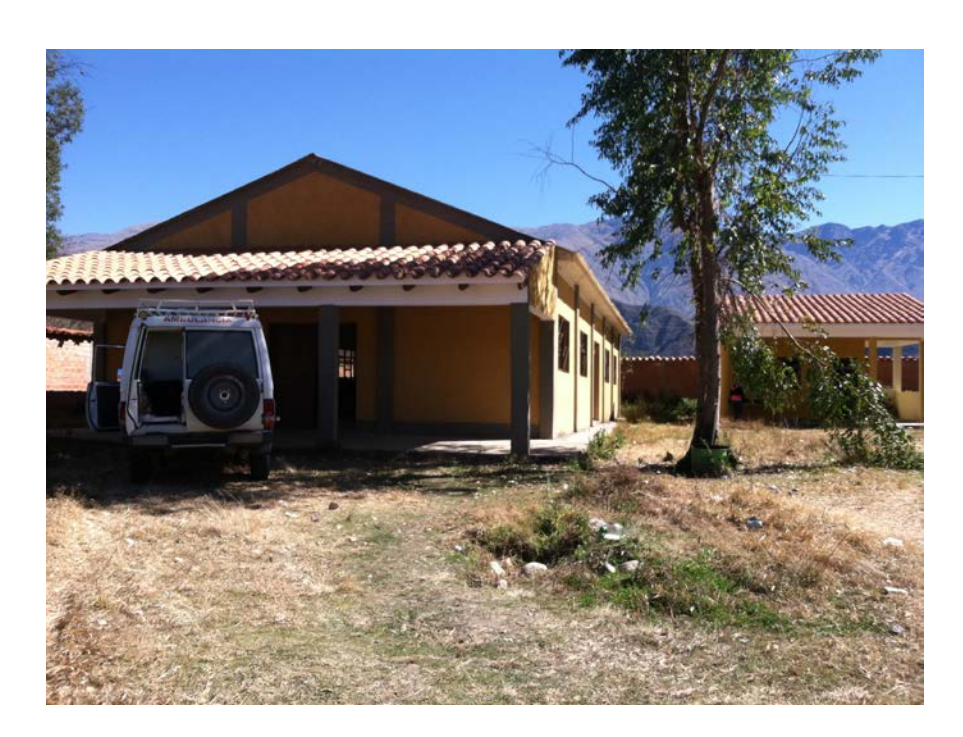
Rural Medicine, Tarija