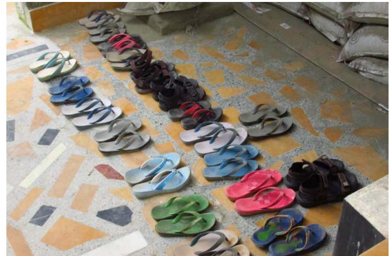
Little flip flops at the bottom of the stairs >>