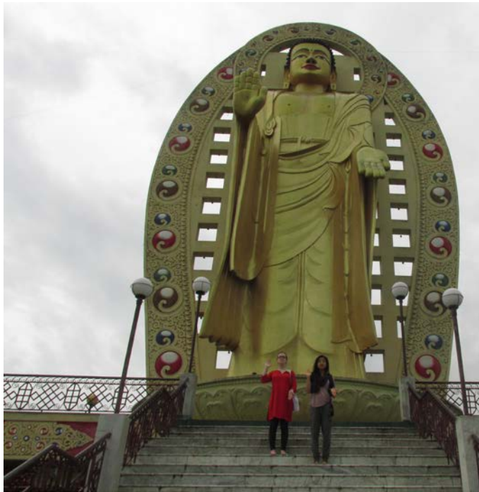
^^ Mindrolling Monastery on the outskirts of Dehradun